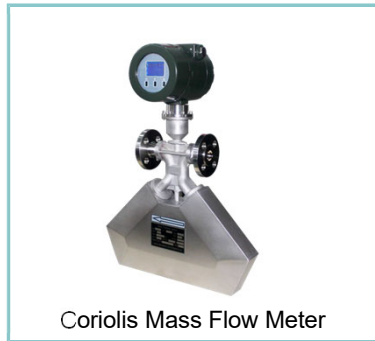
Coriolis Mass Flow Meter