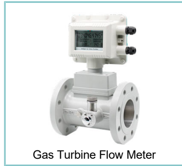
Gas Turbine Flow Meter