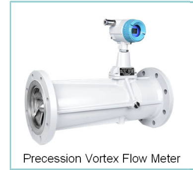
Precession Vortex Flow Meter