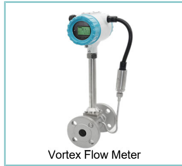
Vortex Flow Meter