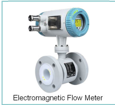
Electromagnetic Flow Meter