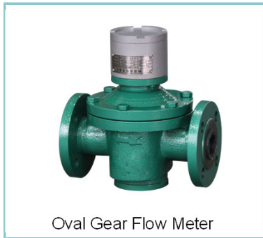
Oval Gear Flow Meter