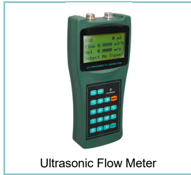
Ultrasonic Flow Meter