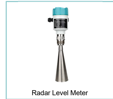
Radar Level Meter