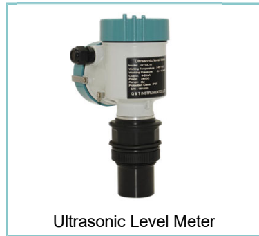
Ultrasonic Level Meter