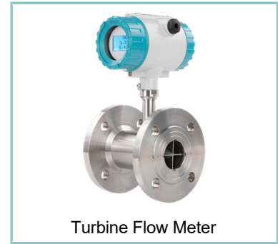
Turbine Flow Meter